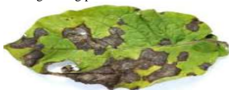
Fig 1. Simple Leaf Dieses

The plant diseases mean the studies of visually observable patterns seen on the plant. Health monitoring and disease detection on plant is very critical for sustainable agriculture. It is very difficult to monitor the plant diseases manually. One major effect on low crop yield is disease caused by bacteria, virus and fungus. It can be prevented by using plant diseases detection techniques. It requires tremendous amount of work, expertize in the plant diseases, and also require the excessive processing time. Hence, image processing is used for the detection of plant diseases. Disease detection involves the steps like image acquisition, image pre-processing, image segmentation, feature extraction and classification. So to detect the plant diseases in advance and to detect the diseases with the help of modern computer technology, proposed a model for the efficient distinguishing plant diseases.